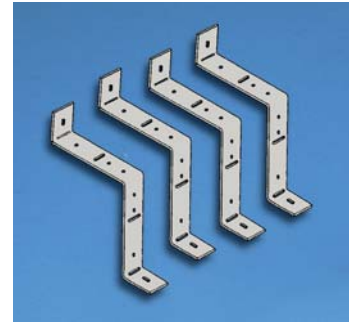
Easily Mounts Under the Counter with Optional Universal Brackets