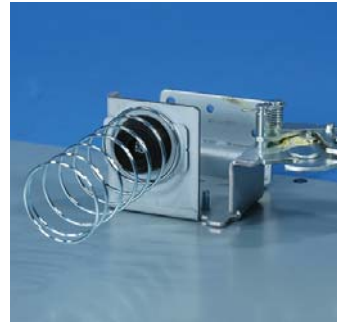
Heavy Duty Latch Mechanism