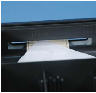
Large Storage Area Under the Coin Section