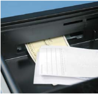
Large Storage Area Under the Insert