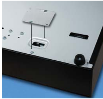
Optional Release Lever Cover Prevents Access to Manual Release