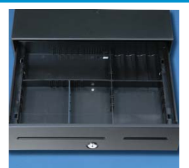
Configure the Storage Area to Your Needs Using the Adjustable Partitions Provided