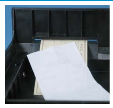
Checks And Card Slips Can be Inserted into the Media Slots Without Opening the Drawer