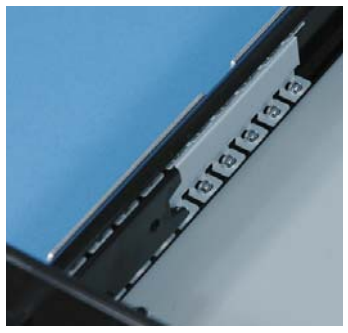
Drawer Glides Effortlessly on Side Rails with 24 Steel Ball Bearings per Rail