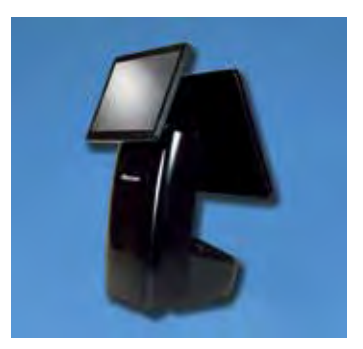
Optional Integrated 10.1" LCD Customer Display