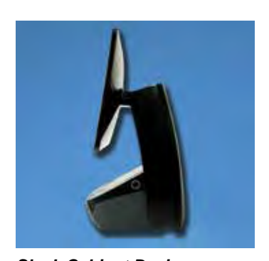
Sleek Cabinet Design