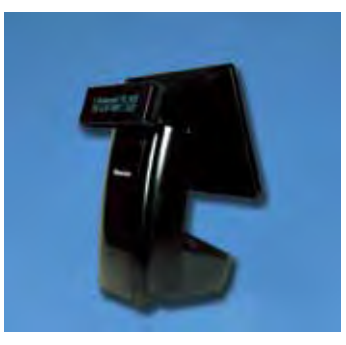
Optional Integrated Rear 2 Lines by 20 Characters VFD Customer Display