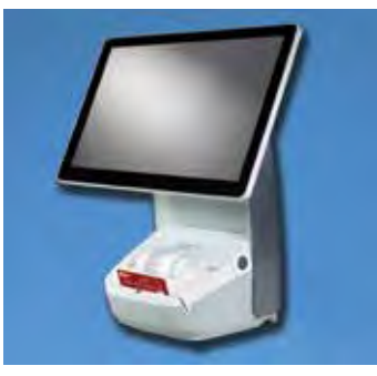
Standard Integrated Card Reader - White Cabinet Shown